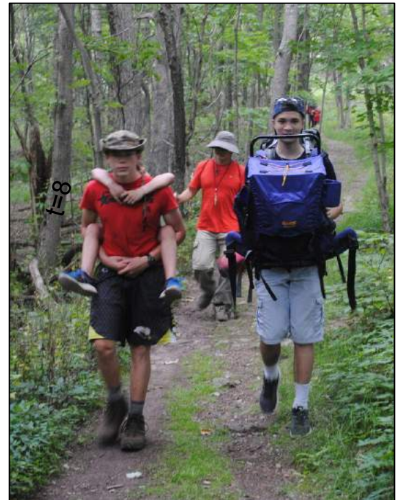
Junior staff lead by serving - their campers, and each other!

What do you see when you envision camp? Do you have a favorite photo or do you want to draw a picture that represents camp? If you do, submit it to Newsletter@camphemlock.org and you might see it featured on the Camp Hemlock Facebook Page!