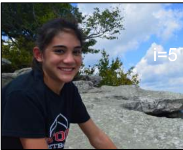
This is not a caption, it is a hint- ↑ is d