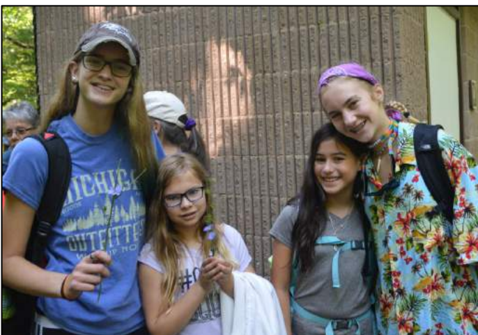
Wildflowers staff and campers enjoying day at Trout Pond