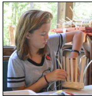
Summer 2017 basket weaving!